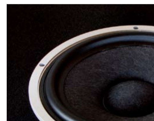
RIGID PAPER CONE